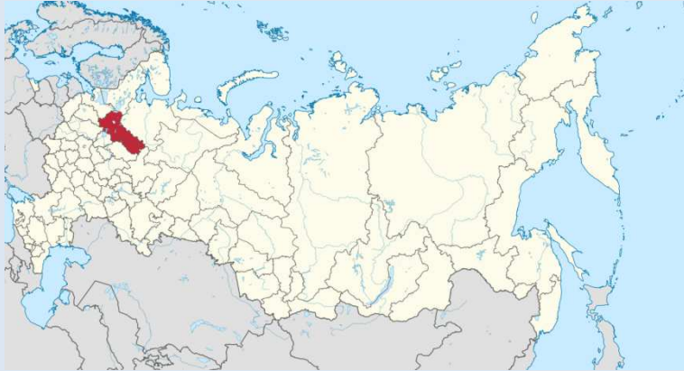
Location of Vologda Oblast in Russia